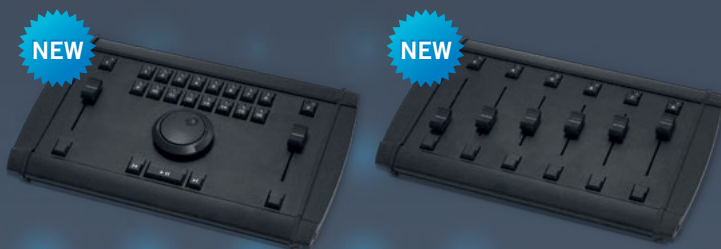
Jog Shuttle Controller and Fader Board

For intuitive live editing Pandoras Box Manager ships with an external Jog Shuttle Controller (STD & PRO versions) and an additional Fader Board to control up to 8 timelines simultaneously (PRO version only). A 19" Workstation is available upon request.