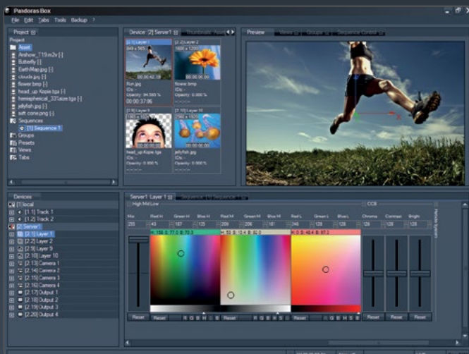
Screenshot of the Pandoras Box Manager Interface

The built-in sequences and cue based timeline interface enables you to control Pandoras Box Servers, Players as well as interfacing with all kinds of external controllers via TCP/IP, Serial RS232/422, SMPTE, DMX, Art-Net, analog and digital industrial sensors.