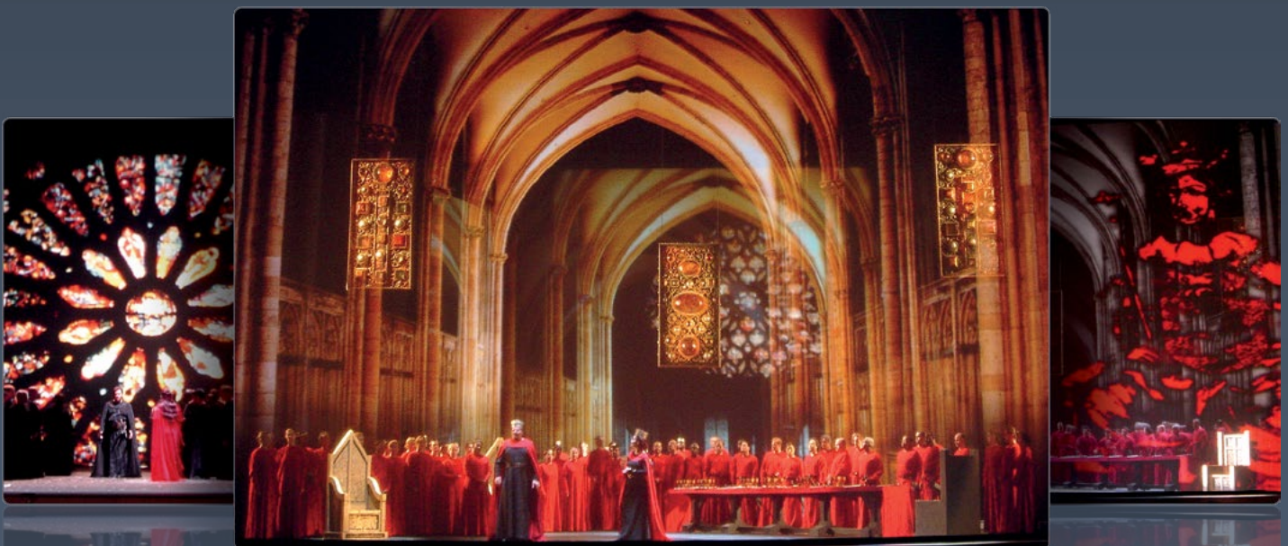
MACBETH - Kennedy Center Washington

The Version 5 Manager now supports all common ASIO sound cards and offers audio and video playback synchronization to the audio clock.