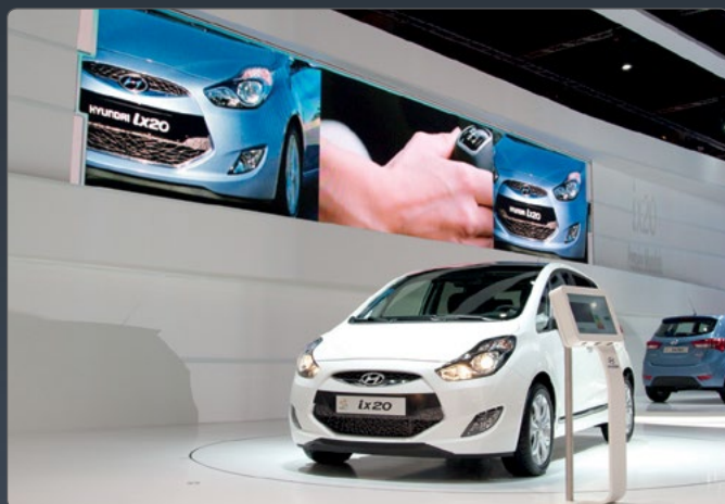
Hyundai product presentation at Salon Mondial 2010